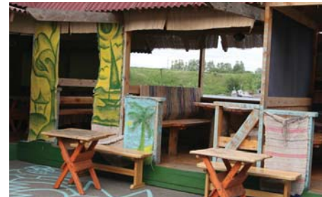
A very hip riverside Ro-Ro club

Lydia Souvenirs Vabaduse 6, tel. 55 57 91 39. ▶ Open 10:00 - 18:00, Sat 10:00 - 14:00, Closed Sun. ☺