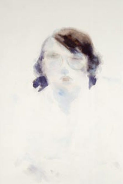
Portrait of Paul Muldoon (1978) by Neil Shawcross. © National Museums Northern Ireland 2006. Collection Ulster Museum, Belfast. Photograph reproduced with the kind permission of the Trustees of the National Museums Northern Ireland