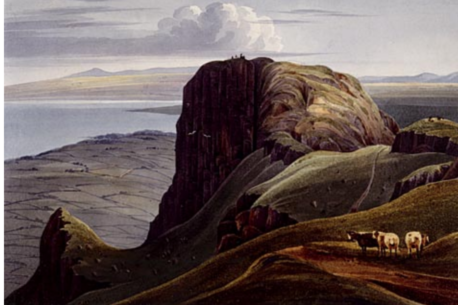
McArt's Fort from the Mountain to between the Fort and the Caves (c. 1828) by Andrew Nicholl.

At the core of the Cathedral Quarter's claim to cultural accreditation stands the John Hewitt, much more than one of the city's most friendly bars, but also a hive of arts activities managed by a cooperative, the Belfast Unemployed Resource Centre. Hardly an evening passes without a poetry slam, a literary quiz, a book launch or a live music session where the disciplines flit from traditional Irish to traditional jazz and all the grace notes in between. It is the watering hole for the area's hacks, musos, art students and arts administrators, plus as many raconteurs as you'd care to buy a pint for. Built originally as part of the offices and print works of the News Letter (established 1737), the oldest continuously published daily newspaper in the English-speaking world, its walls are hung with paintings or photographs by, in the main, local artists.