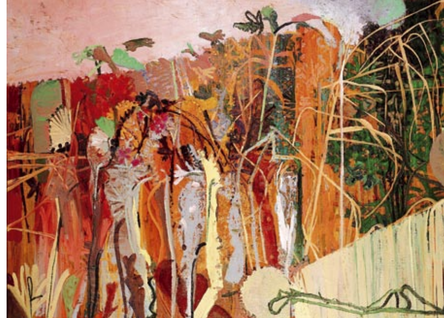
Meadow by David Crone.