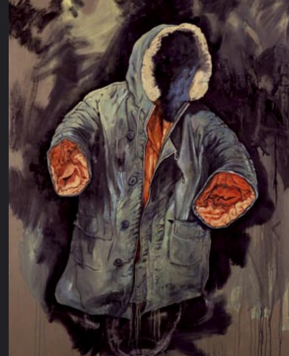
Relic, Oil on Canvas (183 x 122 cms) by Rita Duffy.