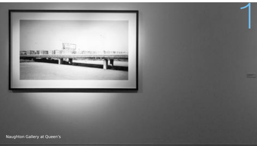
Naughton Gallery at Queen's

Opened in 2001, in what was once the draughtsmens' studio and later the campus telephone exchange inside Queen's University's elegantly Victorian Lanyon Building, the Gallery is a major player on the Belfast visual arts scene. It features a rolling programme of exhibitions from Queen's own extensive collection, which dates from the mid-19th century (Irish painters William Conor, James Humbert Craig, Paul Henry, Louis le Brocquy, Sir John Lavery and John Luke), plus touring exhibitions and the creations of local artists. Each year its directorate runs an open competition based on one of the university's disciplines while co-ordinating the commissioning and purchase of new art works for Queen's itself.