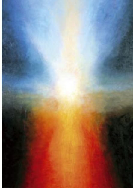
Mystic Synergy by Carol Graham.