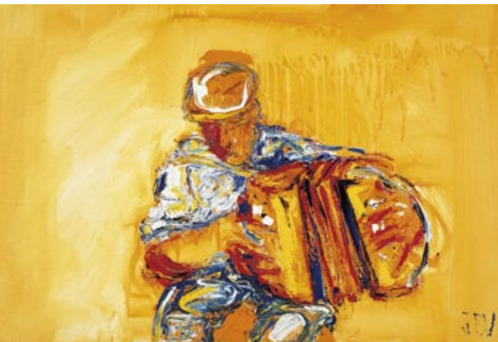
The Yellow Accordion (2000) by John B Vallely, www.jbv.ie